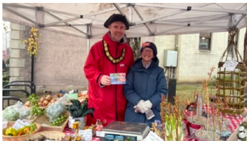
Merry Christmas Root Connections