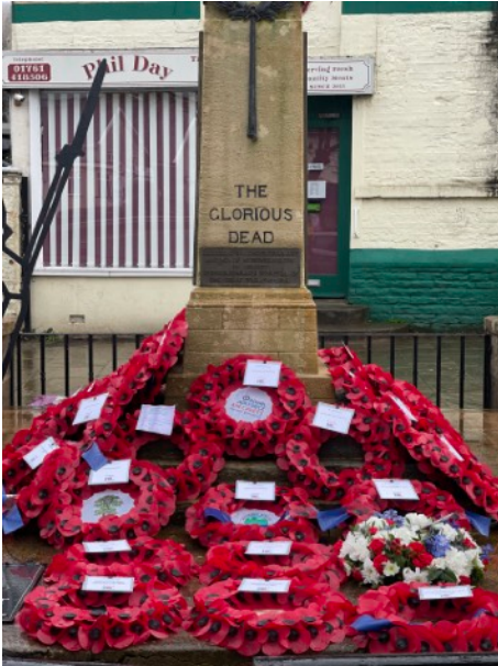
The War Memorial

It was a real honour to lay the first wreath on behalf of the Town Council