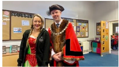
Sugar Rush Confectionary

The School's Christmas Fair was on the 25th November