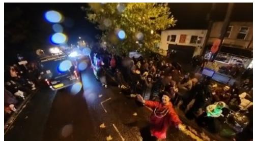
Hello Midsomer Norton