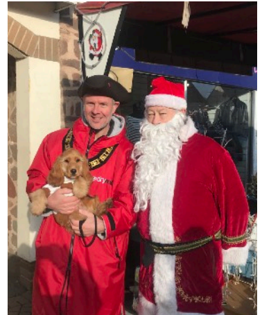
Thank You Lions Club (and Santa)