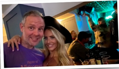
Sharing the Mayoral Hat at the Mallards