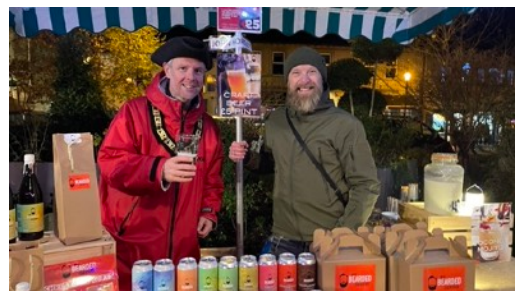
Merry Christmas, The Bearded Brewer