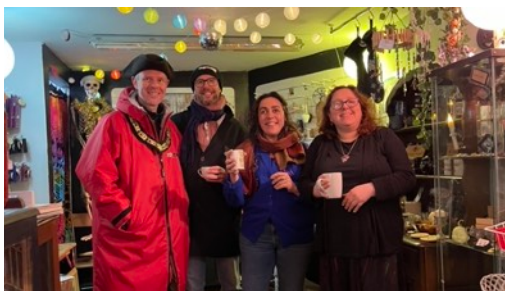
Late-night shopping at Magpie Vintage Curiosities