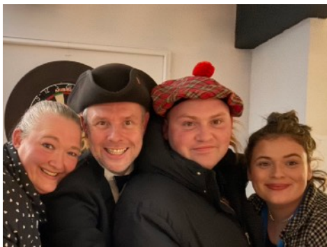
South West Action for Learning and Living Our Way