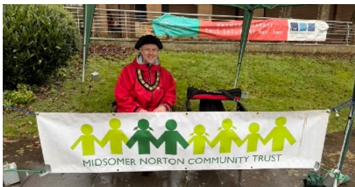
The Community (Trust) Stall