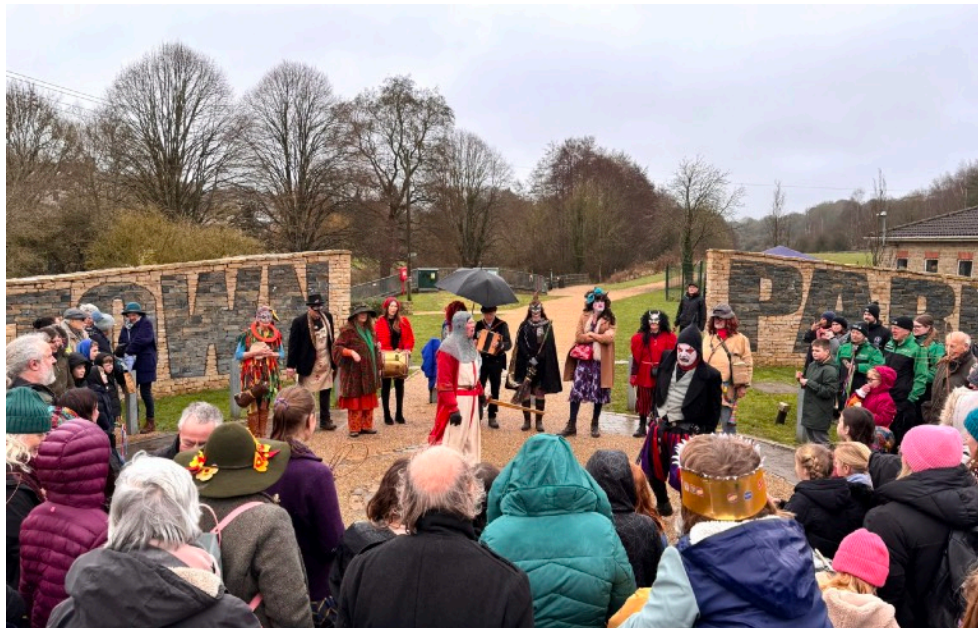
The Langport Mummers performing at the Town Park

The annual Midsummer Norton Wassail returned on Saturday with the Langport Mummers and Cam Valley Morris Men in fine form. It was great to catch up with St George after the battle to hear his take on how it went.