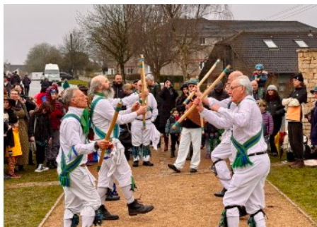
The Cam Valley Morris Men