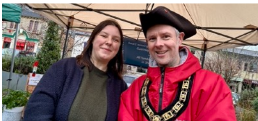
Guest appearance from White Lake Cheese