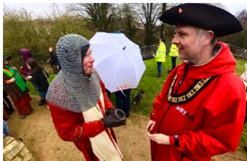
St George after the battle