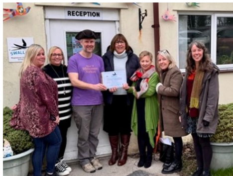
Receiving a certificate from the SWALLOW team