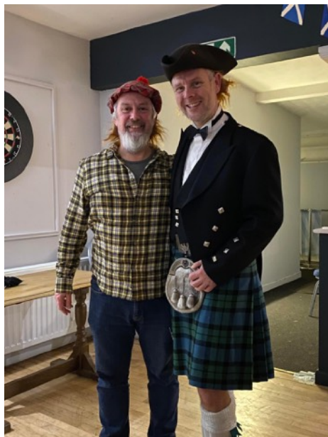
Jimmy Hat - Mayor's Hat