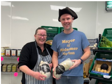
Haggis sponsor : Phil Day Butchers