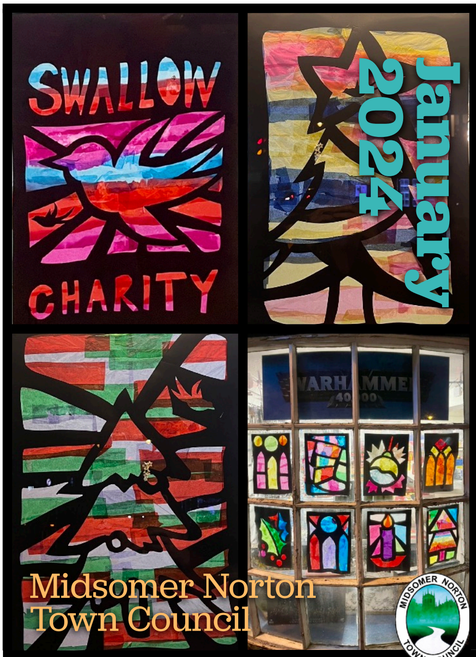
Christmas Arts Trail Window Displays