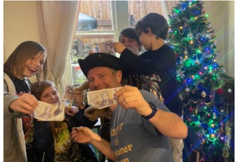
£100 Raffle Prize donated to SWALLOW

Since becoming Mayor of Midsomer Norton in May, I've had the privilege of drawing many raffles but not winning so many myself.