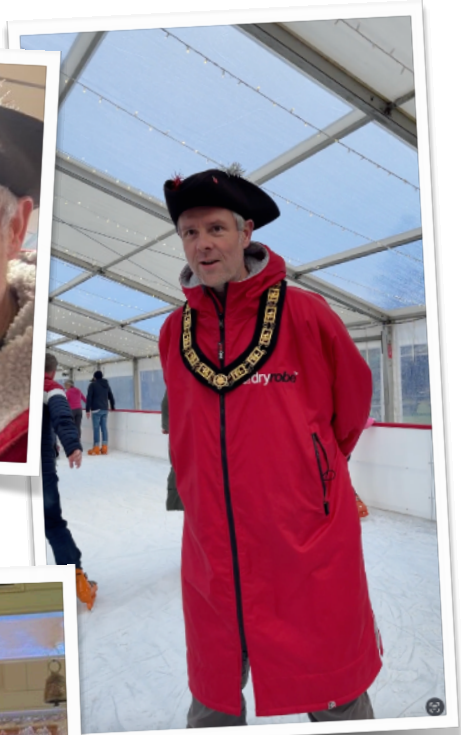
Mayor on Ice @ Planet Volt